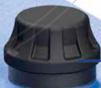
AIR BREATHER & FILLING CAP