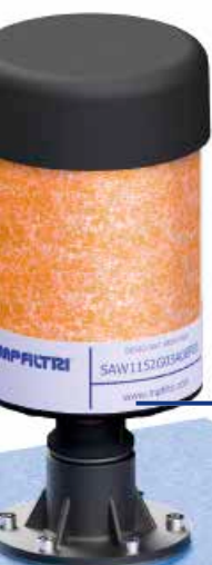
DESICCANT AIR BREATHER

for hydraulic circuits is composed of: breather filters, filler and breather filters, filler caps, visual and electrical level indicators, pressure gauges selectors, flanges for fixing the oil tubes on the tank cover and inspection doors.